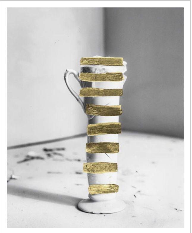
James Henkel, Repaired Tall Cup , 2018; archival pigment print with gold leaf, 10 by 8 in.