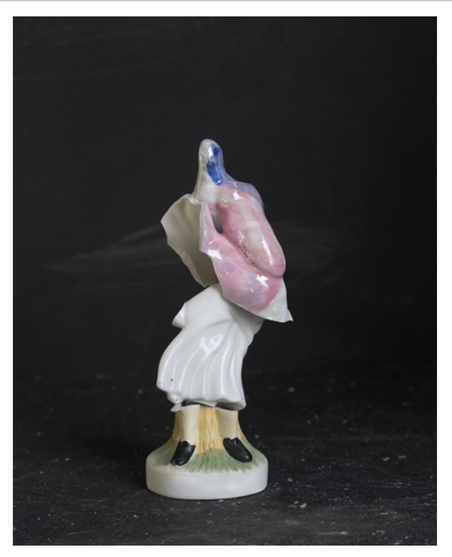
James Henkel, Figure in Pink , 2018; archival pigment print, 20 by 16 in.