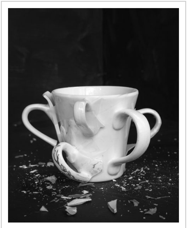
James Henkel, Sharing Cup , 2017; archival pigment print, 20 by 16 in.