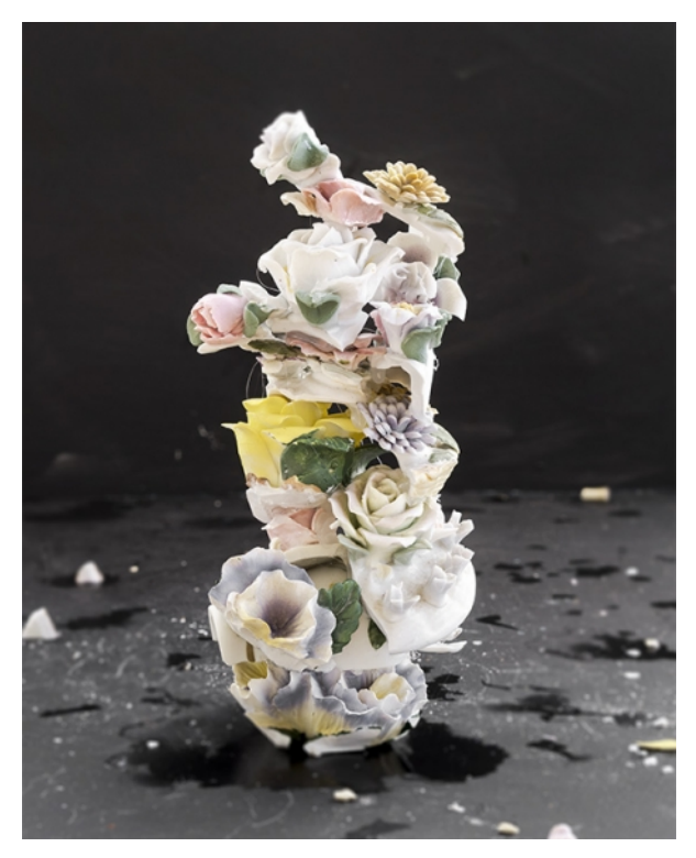
James Henkel, Bouquet , 2017; archival pigment print, 20 by 16 in.