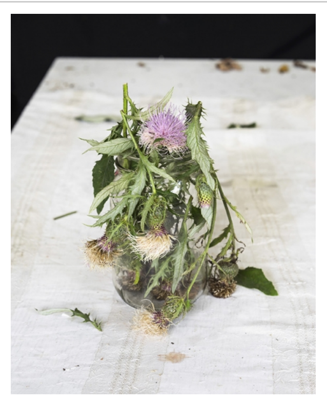
James Henkel, Thistle , 2018; archival pigment print, 20 by 26 in.