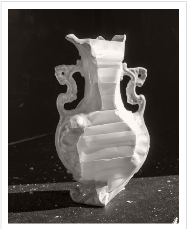
James Henkel, Repaired Vase , 2018; archival pigment print, 20 by 16 in.