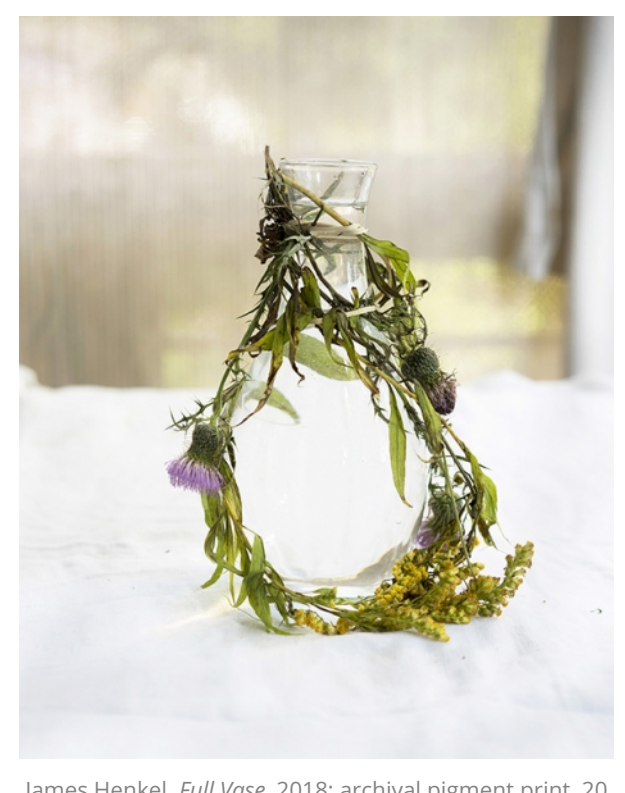
James Henkel, Full Vase , 2018; archival pigment print, 20 by 16 in.