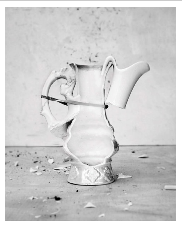
James Henkel, Empty Pitcher , 2017; archival pigment print, 20 by 16 in.