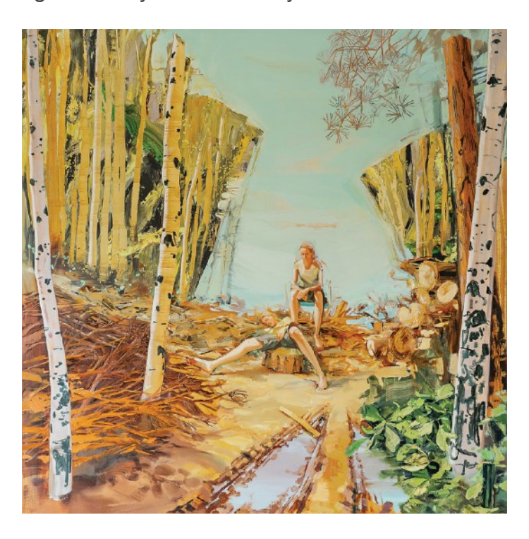
I Came Across My Death in a Clearing

Yes. Life is messed up and weird. In the '90s, I was in New Mexico, gardening in the backyard. I felt scratching on my back. A crow had landed on my head and just stood there and stayed there. Then my neighbor came and pointed up. I looked and there was a funnel cloud forming above my head. Nobody believes me when I tell them that story.