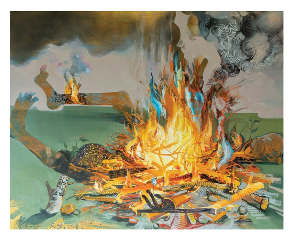
Trial By Fire -The Body Politic

The third and most common way is simply processing experience or thought. Some ideas or experiences seem like they'd make an interesting painting.