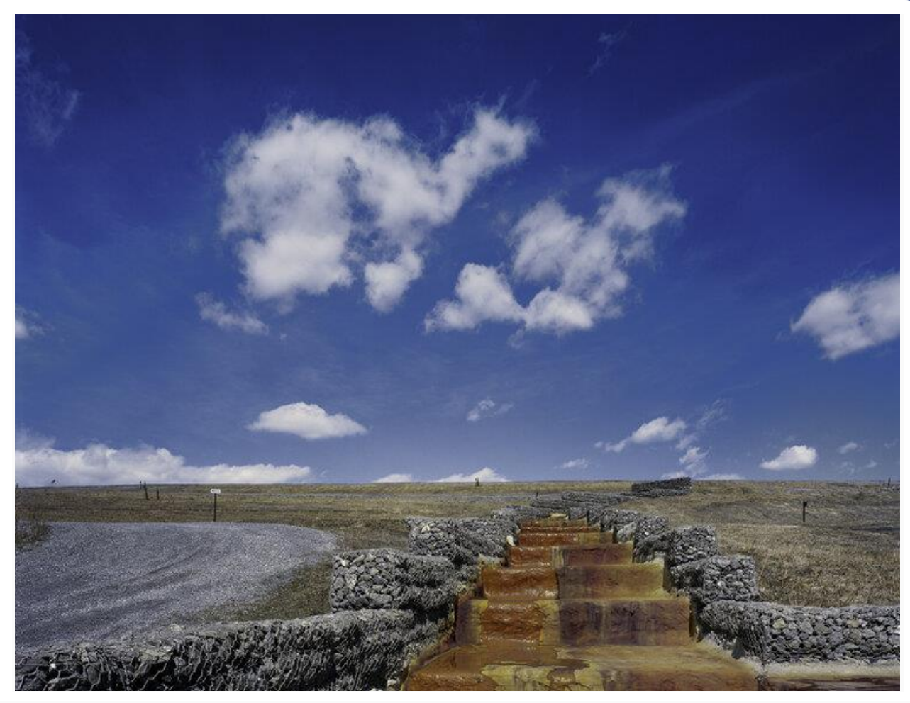
©Jade Doskow, New Roads and Stormwater Structure, West Mound, 2021

There is a great deal of vibrancy and muted colors among this collection of images, both open and feral; and domesticated and closed. Each image holds its own story, they run deep with the people and places that are connected to the land, creating a time capsule for the viewer.