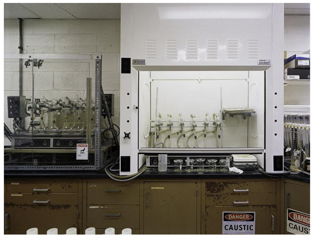
©Jade Doskow, Leachate Plant - Veteran's Avenue Laboratory, 2020/2021