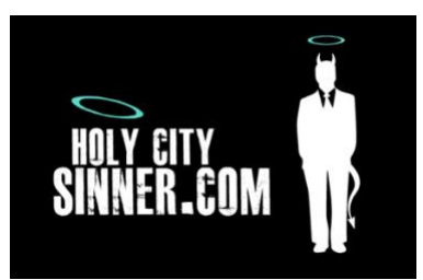
Published on August 3, 2022 By Holy City Sinner