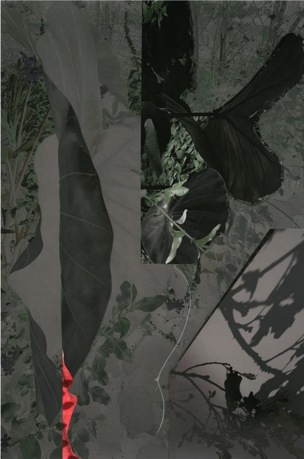
© Sandi Haber Fifield, GD19_289, 2019 Unique Archival Collaged Pigment Prints; Graphite; Vellum 37 1/8h x 26 3/8w x 1d inches