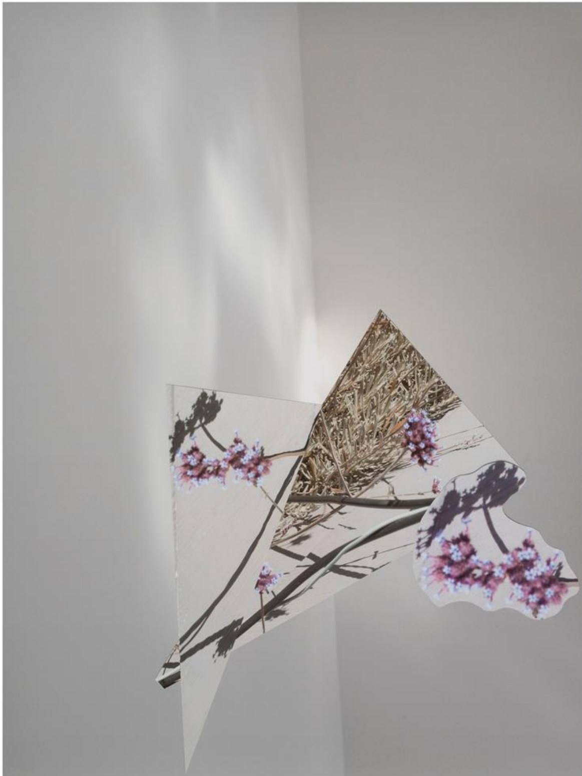
© Sandi Haber Fifield, BE21_401, 2021 Unique Archival Pigment Prints, Collaged 36 1/2h x 28 3/4 w x 1d inches