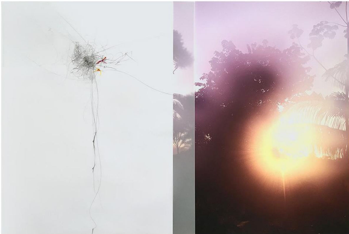
© Sandi Haber Fifield, LF16_146, 2016, Unique Archival Collaged Pigment Prints; Graphite; Wax Pastel 23 1/2h x 31w x 1d inches