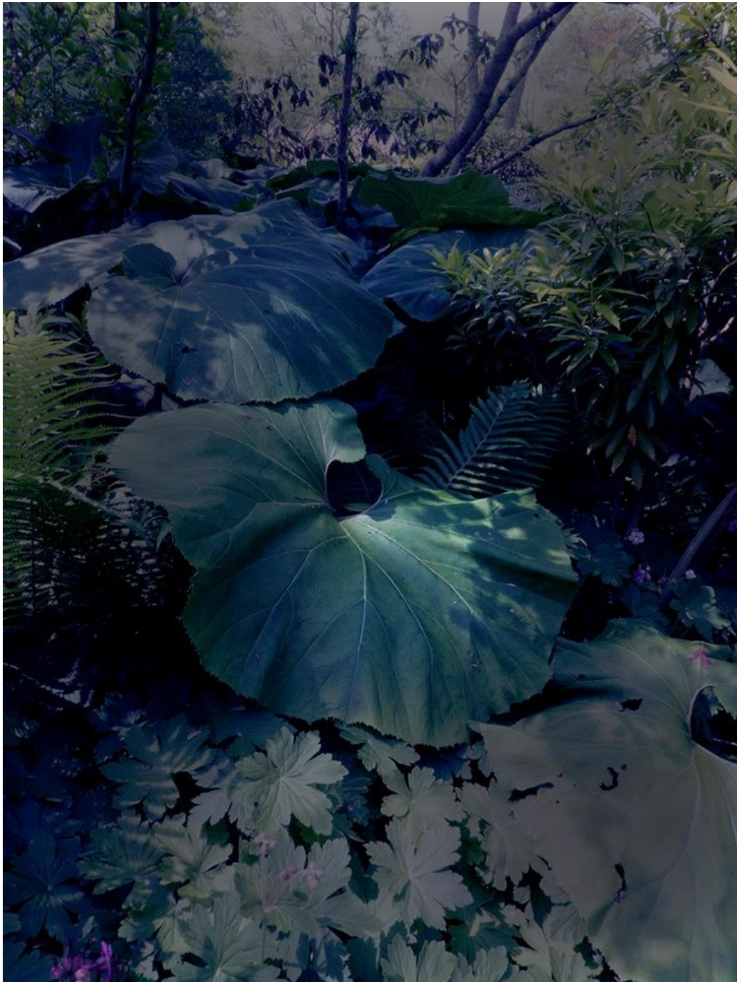
©Sandi Haber Fifield, GD19_309, 2019 Archival pigment print 33 1/2h x 26 3/8w x 1d inches Edition of 5