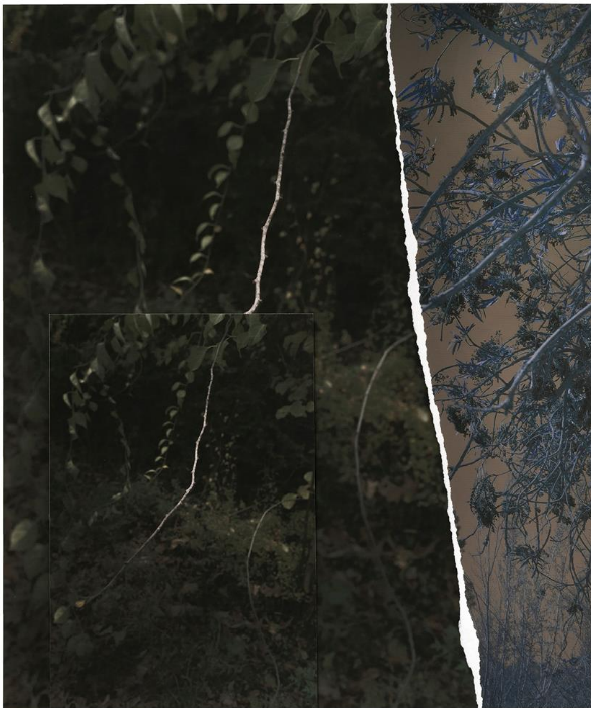
© Sandi Haber Fifield, GD19_279, 2022, Unique Archival Collaged Pigment Prints; Graphite; Vellum; 22h x 19 1/4w x 1d inches

Follow her on Instagram: @sandihaberfifield