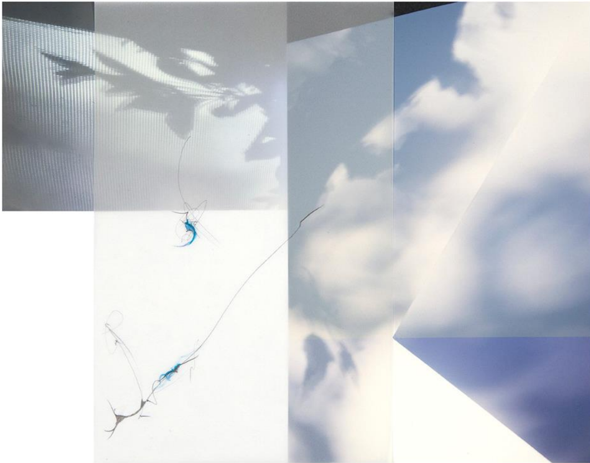
© Sandi Haber Fifield, LS17_184, 2017 Unique Archival Pigment Prints; Graphite; Wax Pastel; Vellum; T-pins 18 3/4h x 20 3/8w inches