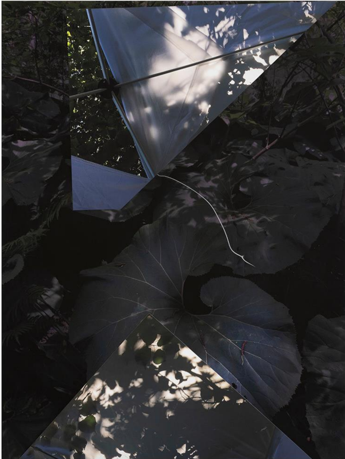
© Sandi Haber Fifield, GD19_314, 2019 Unique Archival Collaged Pigment Prints; Graphite 33 1/2h x 26 3/8w x 1d in