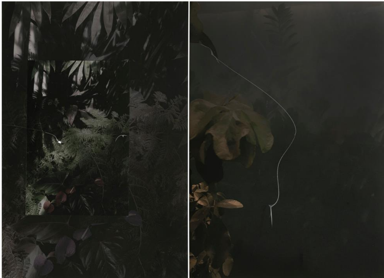
©Sandi Haber Fifiield, GD19_280, 2019 Unique Archival Collaged Pigment Prints; Graphite; Vellum 22 1/2h x 29 1/4w x 1d

In As Birdsongs Emerge, image fragments are frequently thrown into conflict, with no single material or conceptual element outweighing the other. The series seeks not to resolve but question the strata of seeing—finding comfort in the unseen rather than the apparent. The Certainty of Nothing utilizes photographs taken by the artist at the ruins of Angkor Thom and Angkor Wat, two sites built in the 12th century in present day Cambodia, exploring the frailty of civilization and drawing from Hindu legend. The title acknowledges both the inevitability of nature to reclaim itself, and the persistence of these sites of ancient civilization to exist in our modern world. The series Lineations combines straight and altered photography, transparent layers of vellum, and hand-drawn elements of carefully variegated line weight. In these images the haptic and visual elements combine into a compositional whole that encourages conceptual investigation.