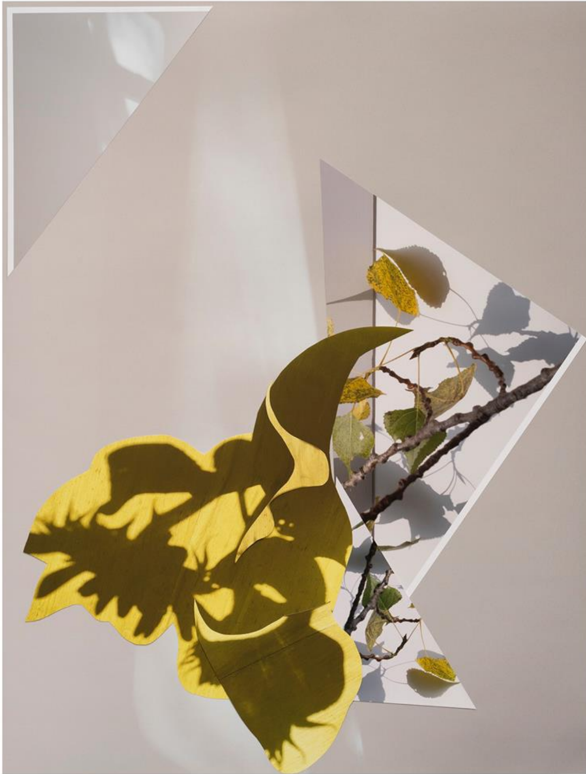
© Sandi Haber Fifield, BE20_355, 2020 Unique Archival Pigment Prints, Collaged 36 5/8h x 28 3/4w x 1d inches