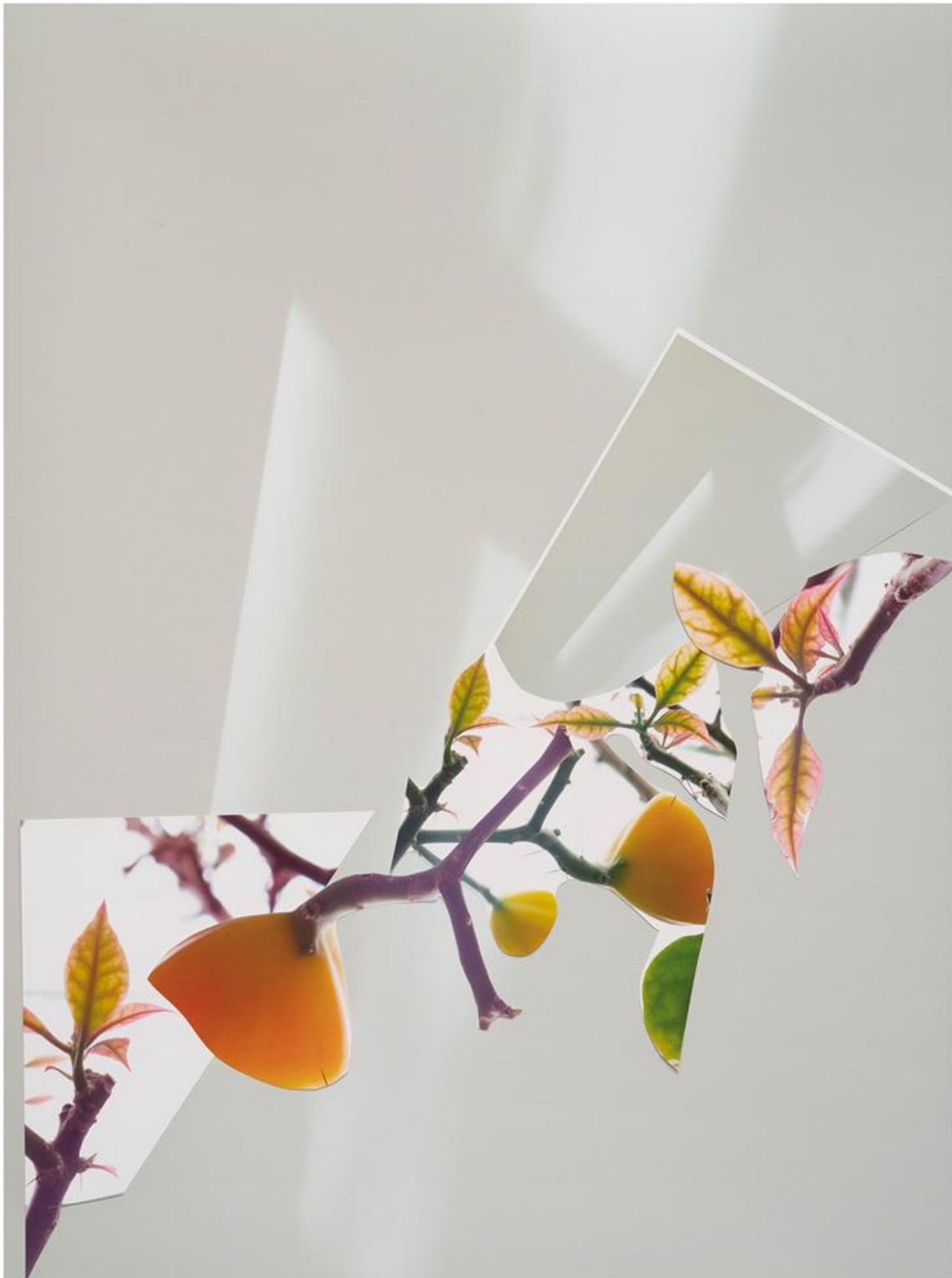
© Sandi Haber Fifield, BE20_357, 2020 Unique Archival Pigment Prints, Collaged 36 5/8h x 28 3/4w x 1d inches